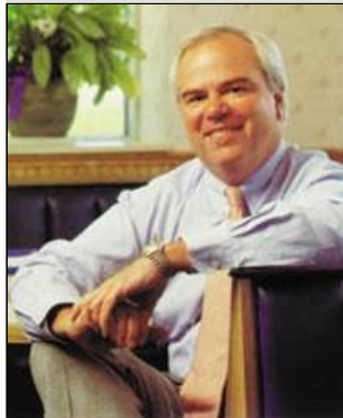
The cafe's name comes from the blue spoons at Craig Culver's other restaurants.

Significantly different but no less appealing was the Blue Ribbon Chicken